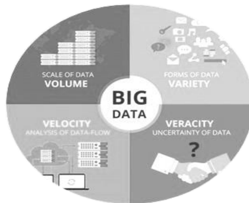
Fig. 2 Four V's of Big Data

Variety: Different forms of data such as structured data which is properly managed like MySQL, semi-Structural data in which some of the data is maintained well and some are not like json & xml, and unstructured data which is not properly maintained like text, audios, videos, etc. are available in this huge database named big data.