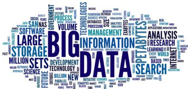
Fig.1 Big Data

Big data is the technology that maintains the huge amount of data. Millions of data is been generated in a single day through various technology with high requirement of proper backup. As most of the data is in continuous form which is used for different-different analysis and other purposes like business trends, legal citation linking, etc,. According to the scenario [5] now the user's requirement are touching the peak. The data storage which previously takes its limits under Gigabyte or Terabyte that now needs more then Zettabyte or Yottabyte.